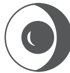
sensors / daylight harvesting