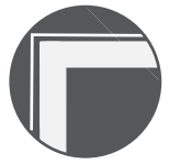
ceiling to wall