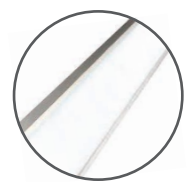
10mm Toughened Glass & Frosted Acrylic Plexiglass