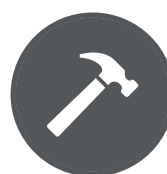
Vandal proof option