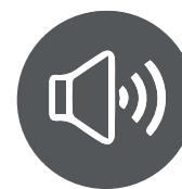
EWIS speaker option