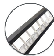
10mm Toughened Glass & Semi Specular Louvre

XTI profiles come with many diffuser options for glare control in any application